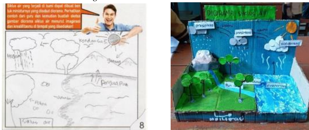
a. Diorama design sketch by group 1

worksheets developed are included in the high value with the effective category. The following is an example of the results of the EDP capabilities facilitated in student worksheets can be seen in Figure 8