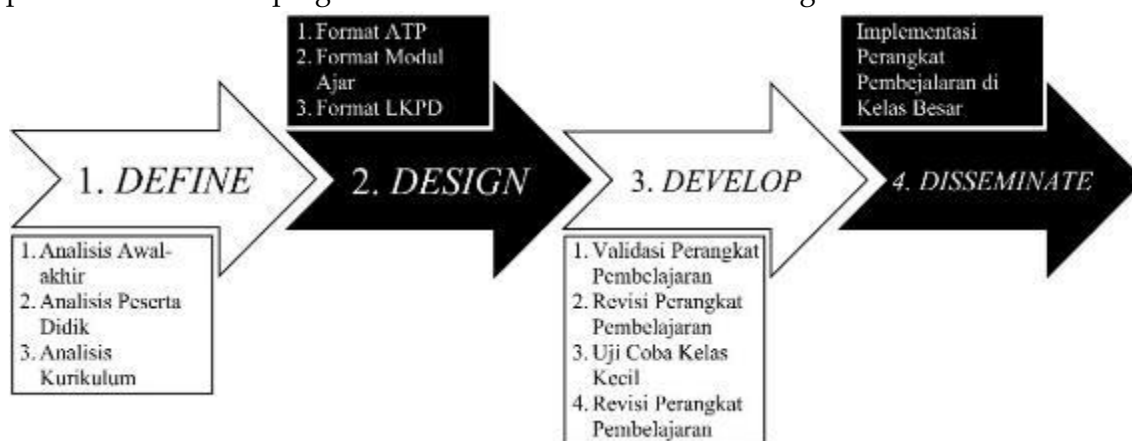
Figure 1. Student Worksheets Development Procedure

This research is a development research. The development used is the 4D model (define, design, develop, disseminate) owned by Thiagarajan, Semmel, and Semmel (Saputri et al., 2019). The 4D development model is very suitable for developing learning devices. The 4D development model is very suitable for use in developing teaching devices because of the analysis of materials and tasks (Agustina & Vahlia, 2016). The research procedures implemented in developing student worksheets are shown in Figure 1.