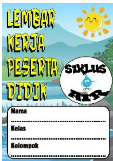
Figure 2. Main cover of student worksheets

The content in the student worksheets contains the flow that students will go through in using the displayed student worksheets, while the PjBL phase and EDP indicators are also integrated into the student worksheets. This aims to introduce and improve EDP to elementary school students. Figure 3 is the design of the student worksheets that were developed.