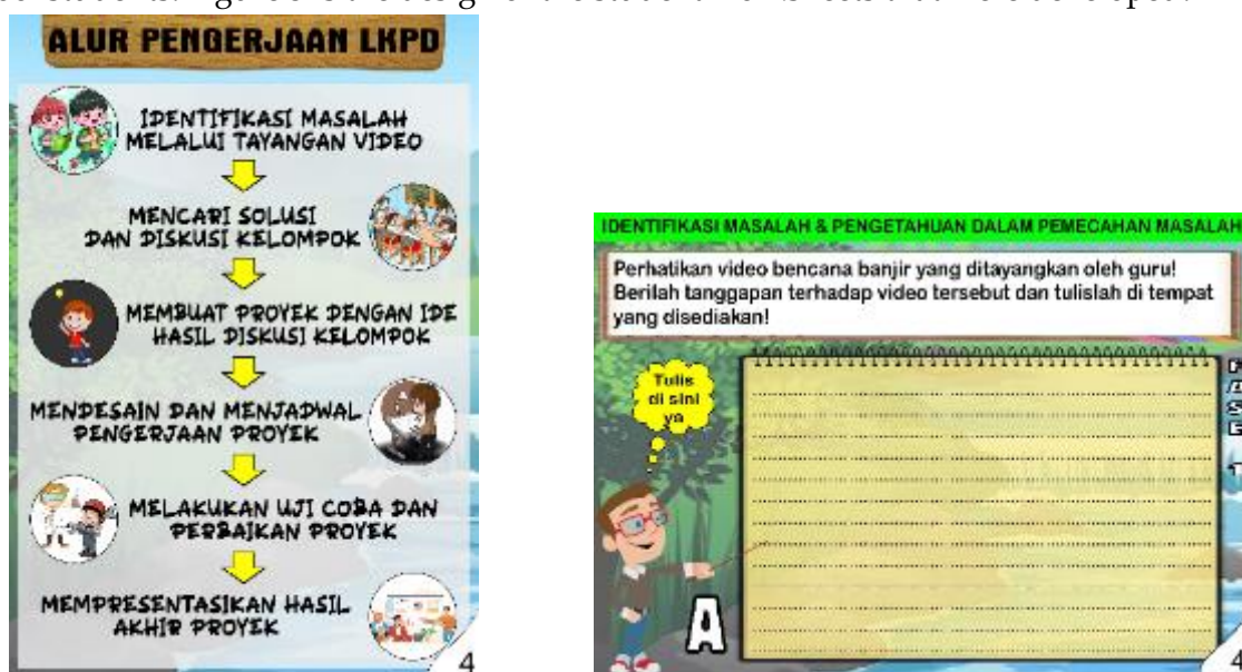
a. Student worksheets processing flow b. Display of assignment content in student worksheets

The content in the student worksheets contains the flow that students will go through in using the displayed student worksheets, while the PjBL phase and EDP indicators are also integrated into the student worksheets. This aims to introduce and improve EDP to elementary school students. Figure 3 is the design of the student worksheets that were developed.