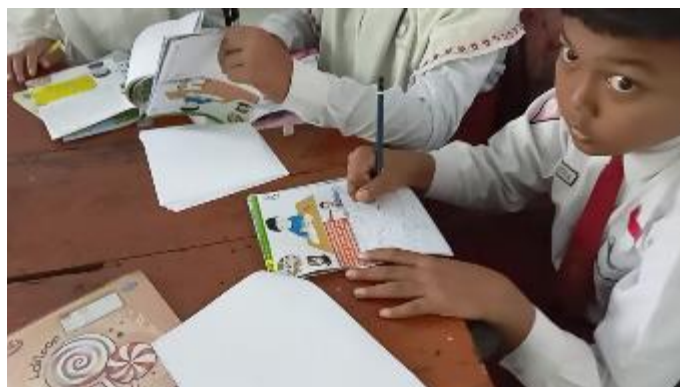
Figure 7. Students make sketches for the projects they are working on